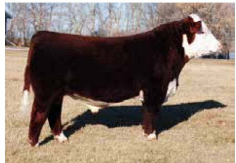
Untapped 425X - Sire of Lot 20

WLB Eli 10H 83T MA 83T Tammy 30P ET 41Y Meadow-Acres 17J Tammy 13K 30P