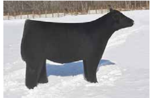
Monopoly Money—Sire of Lot 27

Super soggy made and full of muscle expression, this guy will make one tremendous steer. Great hair and cool marked on his brockle face, you'll love his fluffy ears!