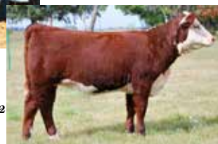
Full Sister to Lot 12

Champion Female Oregon State Fair Maternal Sister