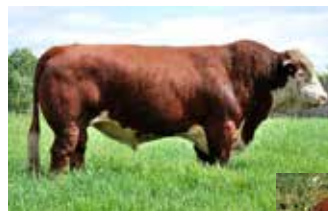
Sire of Lot 14

Triara Unleashed 893U Justamere 893U Bell 628X Justamere 71H Bell 489M