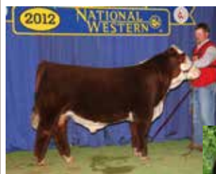
Sire of Lot 18

RSK 030047 Talledega ET 15T RSK 15T Miss Sugar Cane 17X RSK 33L Sugar Cane 36S