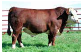
Harley 5Z - Sire of Lot 7

Leveldale-Aywon Sturgis 34X Justamere 64L Showtime 829T Leveldale Harley 34X 5Z Leveldale Aywon Zelda 829T 29Z Leveldale Urgent 15M 18U Aywon 35U Miss Madsen 50U 19X