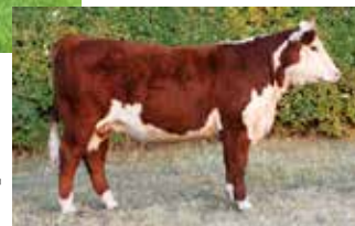
Dam of Lot 14

April 34A is the first female to sell out of the Justamere Bell cow. We admire the natural do-ability that 34A has. Bell 628X has a flawless udder and so do the daughters out of LPH 8T. Now combine Unleashed into the mix there's no doubt we have a brood cow in the making. Exposed to LPH 29A April 5 - July 25, 2014. Observed Bred on June 10.