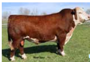
Sire of Lot 11 & 12

Twin-View 9G Game Card 18J Twin-View 18J Allison 13M Square-D Susie 542C