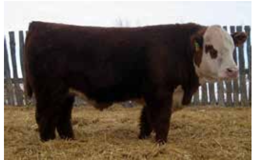
Zoolander 25Z - Sire of Lot 19

Hi-Cliffe 20X LT 51L MNH 51L Scarlet 1U S7R 100C Designer 942K