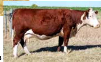
Grand-Dam of Lot 13

Here is the first Leveldale Young Gun 32Y female to sell. Combining Connie 131N, and going back to the Twin View Allison 13M female, there's a great deal of longevity in 25A's pedigree. Not only that, there is a lot of proof to back it up. Miss Rose is sweet fronted, good footed, and crazy dark red. She will do a great deal of good in any calibre of herd.