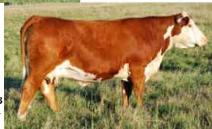
Dam of Lot 3