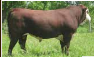
Freestyle 4Z Service Sire to Lot 24

Harvie Traveler 69T RSK 69T Miss Hannah 4X RSK 707B Hannah 20H