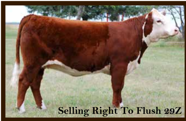
Selling Right To Flush 29Z

S&S Kodiak 64L ANL C P606 Ulysses 35U Justamere 64L Showtime 829T Aywon 35U Miss Madsen 50U 19X Justamere 71H Venus 501M MHR Miss 51K Madsen 153P 50U