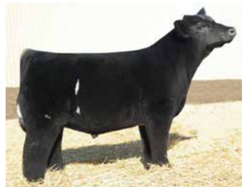
Thriller - Sire of Lot 28

A performance type of steer this guy will just get better the older he gets. Very correct and angular in his makeup you will like the fanciness in this Thriller steer.