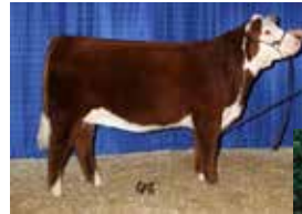
PW Victor Boomer P606

S&S Kodiak 64L ANL C P606 Ulysses 35U Justamere 64L Showtime 829T Aywon 35U Miss Madsen 50U 19X Justamere 71H Venus 501M MHR Miss 51K Madsen 153P 50U