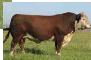
Raftsman 16R - Sire of Dam

Maternal greatness with amazing genotype pretty much sums this calf up, not to mention fancy, thick and long sided. The combination of Victor 719T on the top side and Raftsman 16R on the bottom works great. RSK 29B's Maternal Grandmother is also the Dam of Lot 1, a top donor female in the Phantom Creek Livestock herd.