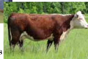
Dam of Lot 18

She is one of the first Rhino 48Y females to sell in Canada and out of the dam of RSK Freestyle 4Z, could this get any neater. Her dam RSK Sugar Cane 17X is one of our top producing females and has raised some very powerful and consistent offspring including RSK 55A (MLE and CWA Class winner) and RSK 719T Freestyle 4Z.