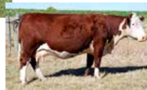
Dam of Lot 11

Allison 14A comes from our embryo program and we wish there would have been 20 of her. 719T crossed with the Twin View Allison 13M cow really was a great combination. Feminine, long bodied, and super deep is what Allison 14A is. Safe to Harley 5Z, the calf to come will be a sale topper. Exposed to Leveldale Harley 34X 5Z April 5 - May 23, 2014. Observed bred on May 6th.