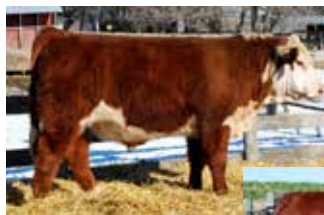
Sire of Lot 13

Justamere 64L Showtime 829T Haroldson's Reload 85P 65T Leveldale Young Gun 829T 32Y Leveldale Red Rose 65T 13Y McCoy 32K Connie 131N Twin-View 18J Allison 13M