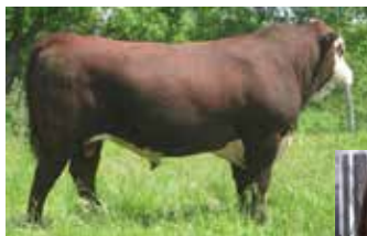
Yuma 24Z Service Sire to Lot 23

Remitall Route 66 ET 346R RSK 346R Miss Kim ET 14X Remitall Kim 10L